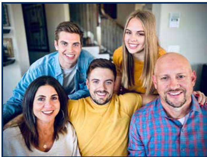
The Traylor Family